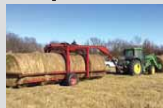
The entire Binkley bale hauler lowers hydraulically to the ground to pick up bales.

“The operator lowers the rails to the ground, then drives forward to pick up the bales. The rails slide under the bale and the