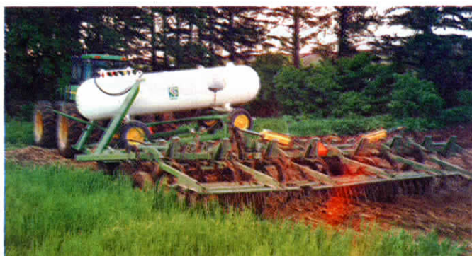
Nurse tank is hauled in front of chisel plow on caddy that's 10 ft. long with 6-ft. tongue.

The men figure they increased productivity 30 percent and they now do a better job. They also changed to a larger, 1,500 gal.