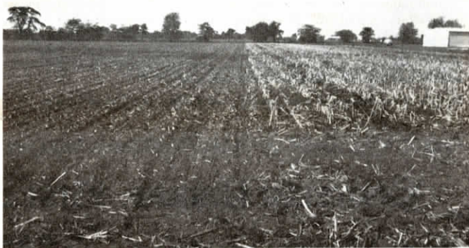
Photo shows, on left, where Tiller-Planter has gone into untouched corn stalks to prepare seedbed, apply fertilizer and herbicides, and plant, all in one operation. Tiller-planter stands in front of same field ready for harvest. The Crows are experimenting to see if chiseling corn stalks in the fall would be desirable.

For more details, contact: FARM SHOW Followup, Hoe Corp., Harold Crow, Box 270, Milford, Ill. 60953. (ph. 815 889-4513).