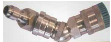
The 4-in. long Wand Wizard has a male coupler at one end and a female coupler at the other, and a spring-assisted locking collar in the middle.