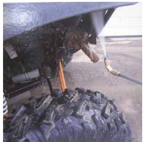
Rotating attachment lets you adjust the spray tip on your power washer at multiple angles, anywhere up to 90 degrees.