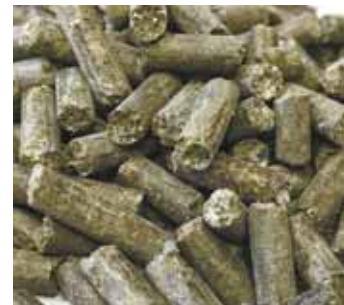
Asmus Egg Farms says its dehydrated, pelletized poultry manure makes great fertilizer. The manure drying equipment was imported from Germany.

in 1, 4 and 20-lb. packages (from $3.99 to $19.99). Loose bulk and 1-ton super sacks are also available.