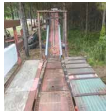
Trailer is equipped with 2 draglines, allowing Simmonds to quickly unload small square bales off the back end. Metal panels cover dragline when trailer is loaded with bales.