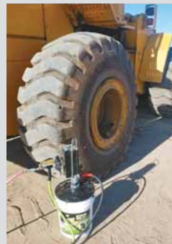
Monster Seal tire sealant pumping system hooks up to an air compressor to work fast.

Ingersoll Rand and works only with Monster Seal sealant.