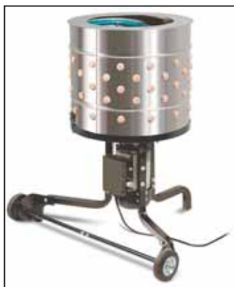
Chicken plucker comes with 110 replaceable rubber fingers mounted inside a stainless steel tub. A built-in irrigation ring supplies water to help remove feathers from birds.

Contact: FARM SHOW Followup, Yardbird, 1160 8 th Ave., Cumberland, Wis. 54829 (ph 800 345-6007; info@yardbirdpluckers.com; www.yardbirdpluckers.com).