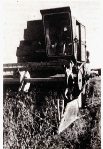
New row divider (above) fits any header with or without a floating cutterbar. Three aluminum pipes (below) guide the crop inwards toward the reel.

For more information, contact: FARM SHOW Followup, May-Wes Manufacturing, Gibbon, Minn. 55335 (ph 507 834-6695).