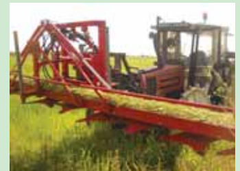
Meneguzzo weed topper uses star-shaped rotors equipped with cutterbar knife blades.

Contact: FARM SHOW Followup, ETR Breton, 12 Rue Des Varennes, 10140 Vendevre-sur-Barse, France (ph 03 25 41 36 65; www.etrbreton.fr).