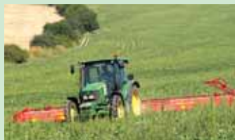
Weed Surfer cuts with ten 4-blade rotors. Operating height ranges from 12 to 39 in.

Contact: FARM SHOW Followup, Zurn USA Inc., 9210 Wyoming Ave., Ste. 215, Brooklyn Park, Minn. 55445 (ph 618 218-3858; toll free 800 780-4872; michael.kathalynas@zuern.de; www.zuern.de).