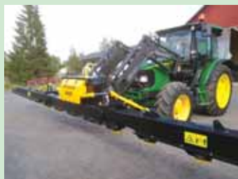
W-Cutter uses electric motor-driven rotors equipped with thin steel chains.

Contact: FARM SHOW Followup, Bionalan, 31 Grande Rue, 08210 Euilly Et Lombut France (ph 33 3 24 22 20 60; info@bionalan.fr; www.bionalan.fr/en/).