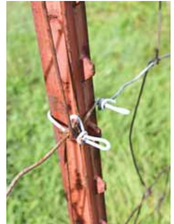
Drill is used to bend prongs one at a time around fence wire. “It's safe to use and works fast,” says Ajit Rose.

He says the key was coming up with a clip with just the right bend length and angle to tie the clip to the wire perfectly tight. “It works fast - each clip can be tied in less than 10 seconds from start to finish,” says Rose.