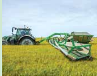
Top Cut Collect trims weeds above crop and retains trimmings for off-field disposal.

Herbicide resistant weeds and expanded organic crop production are driving renewed interest in mechanical weed control. A number of European companies are offering weed clippers of varying styles. The CombCut from Sweden (Vol. 40, No. 3) was introduced in the North American market several years ago. The Weed Surfer has been available since early 2020 and the Top Cut Collect soon will be.