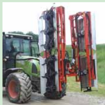
ETR Topper rotors are fitted with 4 boomerang-shaped blades.

Contact: FARM SHOW Followup, W-Cult Oy, Luvian Kirkkotie 30, 29100 Luvia, Satakunta, Finland (ph 358 400 715 728; markku.weckman@w-cult.fi; www.w-cult.fi).