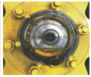
Camso Cap KCP3777

“Kile® Clear View® Caps” are designed for rubber track tractors. See the level & clarity of the oil in idlers and rollers.