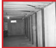
Gorilla® Wall Braces

The Gorilla® wall brace is very easy to install & we have had many homeowners install the braces themselves with good success. The Gorilla® brace pushes off from 3 floor joists, thus dramatically reducing the pushing, twisting & stressing when pushing from only one floor joist. The Dry Up System simply collects the water from where the floor & wall meet & channels it away.