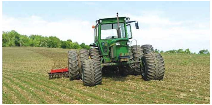
Forde cultivates newly emerged crop at a 45 degree angle using a rotary hoe with the hoe wheels turned backward.

Contact: FARM SHOW Followup, Curt Forde, Profit Organics, P.O. Box 141, Viroqua, Wis. 54665 (ph 608 606-0810; www.profitorganics.net).