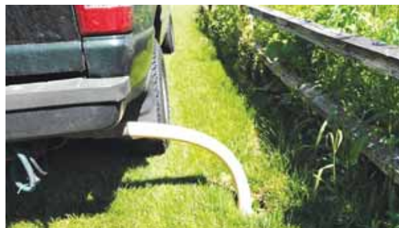
A 4-ft. length of 1/2-in. foam pipe insulation was sealed along its split, then stuffed into pickup’s exhaust pipe.

Contact: FARM SHOW Followup, Dennis Howell, Vernon Center, Minn. (ph 507 380-4375).