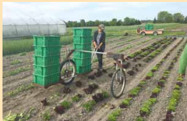
Straddle cart’s tires are 60 in. apart to fit between rows of zucchini or lettuce. Workers load totes onto a pair of platforms.

Allaway notes that he upgraded the load-bearing wheel from a standard mountain bike wheel/tire to a fat bike wheel/tire. If he or