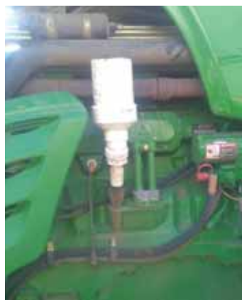
Pvc pipe funnel has a 22 1/2 degree bend to keep it upright when filling.

The pieces are glued together. Costs are about $10 to $15 per funnel, unless you have pvc laying around to use, says Howell. “I have made about a dozen of these for friends and neighbors. They’re easy to make and don’t cost a lot. You can angle them however you need to fit a particular piece of equipment.”