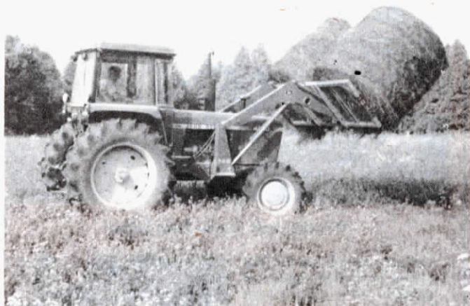
Bales can be stacked and retrieved two at a time with twin prongs.