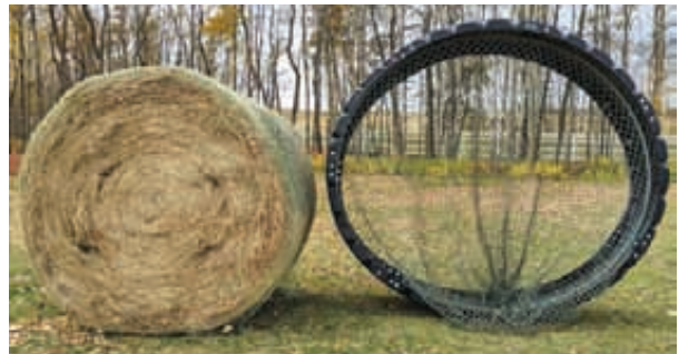
Hay rings are made from recycled high-density poly so they won't corrode.