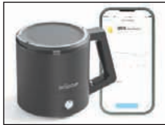
The SCiO Cup can analyze forage, corn, soybeans, wheat and berries.

Both purchases include a one-year license for the SCiO device and app.