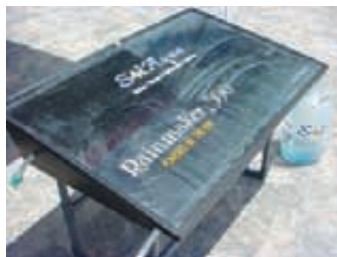
The Sol Aqua Rainmaker distills water using its special liner designed to be waterproof and handle the heat of the sun.

"Many people in the southwest U.S. and northern Mexico have arsenic, fluoride or high salts in their water, and the distillation