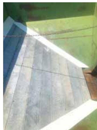
Aeration flooring used as flooring in a gravity box wagon helps dry down seed.

"We now cut the legs, so the flooring is around 2 in. off the wagon floor," says Ravenkamp. "We've used them for lots of small seed batches like clover and alfalfa.