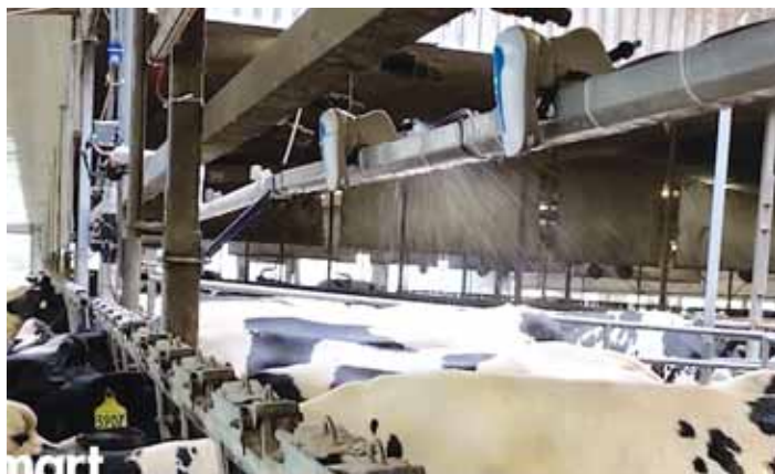
Smart sensors monitor the temperature and humidity in the area of the cow to be sure that each soak is the right amount.

Contact: FARM SHOW Followup, Tony Wendler, Farm Shop Mfg., 1042 570 Ave., Armstrong, Iowa 50514 (ph 712-520-6051; sales@FarmShopMfg.com; www.farmshopmfg.com).