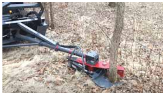
The Mini Clip attaches to front-end loader arms with universal quick attach brackets. Weighing only 632 lbs., it requires only 1,200 lbs. of lift capacity.

Contact: FARM SHOW Followup, Scott Ravenkamp, 52570 883 Rd., Verdigré, Neb. 68783 (ph 719-740-0705; sravenkamp@icloud.com).