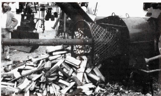
A 7 in. dia. log, fed into the new splitter by hand, is chopped into fireplace size lengths in seconds.

Contact: FARM SHOW Followup, Martin Hanke Firmen-Gruppe, Richard-Seiffert Strasse 26, 5060 Bergisch Gladbach 2, West Germany (022 02 37802).