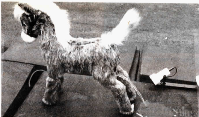
Stuffed horse demonstrates how liquid soaks right through chopped rubber flooring.

Contact: FARM SHOW Followup, Gebr. Schumacher GmbH, 5231 Eichelhardt (Westerwald), West Germany (ph 02681/3681).