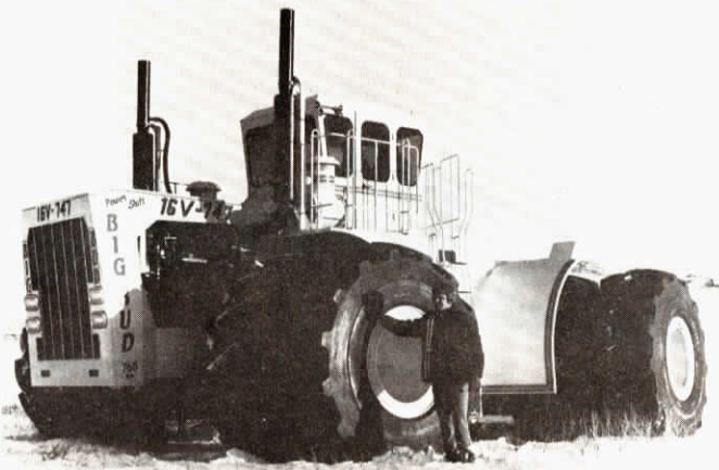
Price tag on the 750 hp Big Bud is in the neighborhood of $300,000.

For more details, contact: FARM SHOW Followup, Zachary Co., 1407 West Main, Beresford, S.D. 57004 (ph. 605 763-5018).