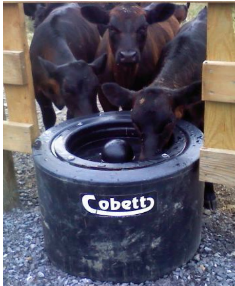
Cobett’s earth-heated livestock waterer consists of a plastic watering tub that’s partially buried below ground.