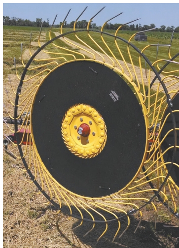
Silencer consists of 1-piece plastic bands that slip over rake wheel teeth and bolt together on the ends. Bands reduce damage to teeth in rough conditions.