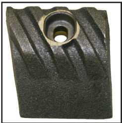
K 505TD Kile Thresh Bar