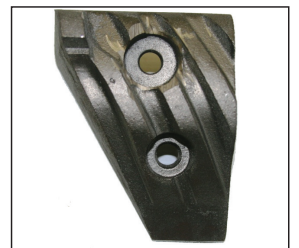
K521-2 Spike Sm Tube Bar