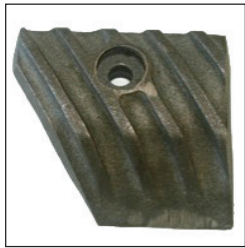
K 506 Kile Thresh Bar