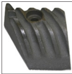
K 507 Kile Thresh Bar