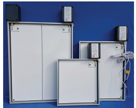
Reader Inquiry No. 82

This kit will allow you to have a light in your coop that you can turn on any time or use the built-in timer to give the hens extra hours of daylight to keep them laying into the fall. Includes a 3-watt high-efficient LED light and a controller. You can add the 15-watt solar panel (shown in the background).