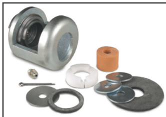
Dodge Track Bar, Tie Rod End Kit 1994-2007.5