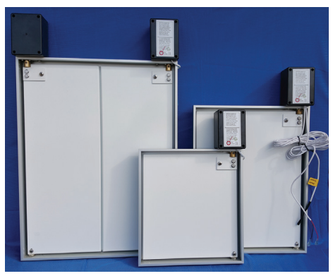
Reader Inquiry No. 82

controller. You can add the 15-watt solar panel (shown in the background).