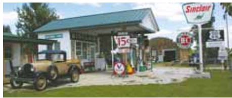
This rebuilt Sinclair gas station is a popular tourist stop on Route 66 near Springfield, Mo. The original burned down in the 1950's.