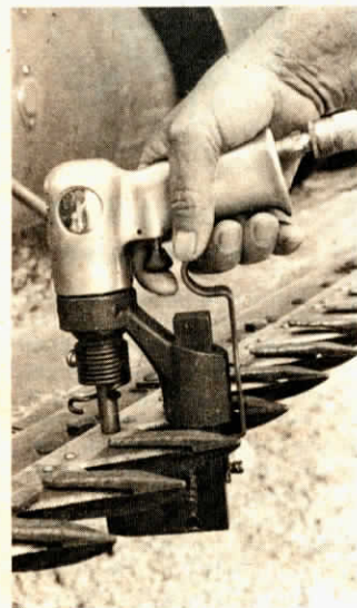
Sickle Servicer removes old rivets and installs new ones.

FARM SHOW Followup, Cook Tool Co., Rt. 1, Box 146, Trimble, Tenn. 38259 (ph 901 536-5100; evenings call 536-5340 or 297-3636).