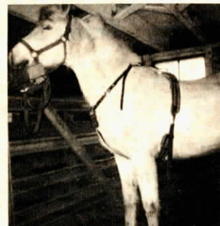
Alarm transmitter straps to mare's chest.

The alarm consists of a harness that wraps around the front of the mare's belly and up through the front legs. A monitoring unit rides against the animal's chest. It measures relative humidity — a combination of temperature and moisture — so that, as the animal heats up and begins to sweat