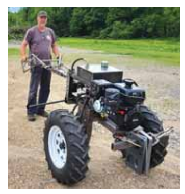
Tractor has zero-turn capability with controls at the hand grips.

"It's been fun as we do things and learn from our mistakes," says Clemmons. As with all open-source designs, every model is to some extent simply the latest prototype. We welcome any design suggestions that we can include as we move along," he says. "We continue to learn with every prototype