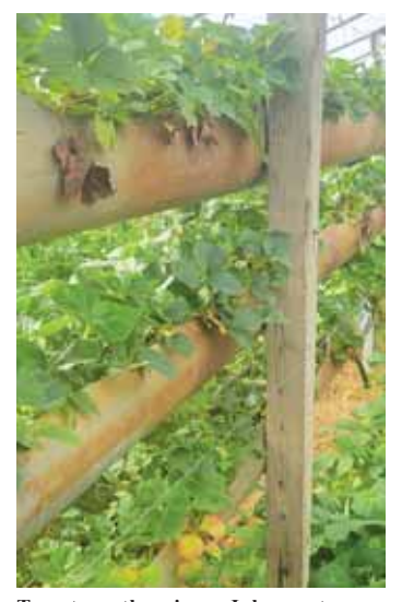
To set up the pipes, Johns cut away portions of each, leaving sufficient metal to maintain pipe integrity.

Contact: FARM SHOW Followup, Kevin Johns, 13423 State Highway WW, Dudley, Mo. 69396 (ph 573-421-6102).