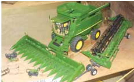
DeBoer's models are so detailed most people assume they're made out of metal.