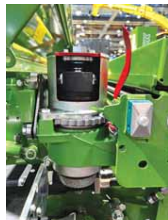
The new system from Krone can go up to 2,200 grinding cycles without a manual reset of the grinding stone.

The new system's guide shaft is lighter weight and smaller in diameter. Propped in four positions at 267-mm (10 1/2-in.) intervals versus 1,160-mm (45 1/2-in.) intervals, it has increased stability and reduced vibration. This cuts the risk of deformation and bouncing. Improved positioning of the grinding faces