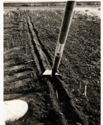
As new hoe covers seed furrow it makes two shallow furrows parallel to row that collect water.

SHOW Followup, Weitekamp Tools, Inc., Rt. 1, Box 62, Harvel, Ill. 62538 (ph 217 229-3538).