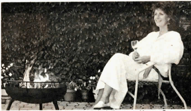
You can cook on the "Brola" or simply enjoy it like you would a campfire.