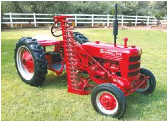
One-of-a-kind Farmall was modified and has been fully restored.

Contact: FARM SHOW Followup, Ardbeg Distillery, Port Ellen, Islay PA42 7EA, Scotland ( www.ardbeg.com ).