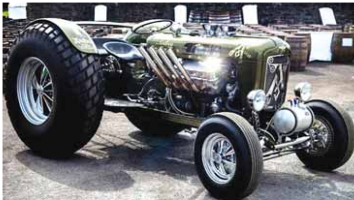
Ardbeg Distilling of Scotland commissioned rebuilding a 1959 Massey tractor into a hot rod to celebrate 200 years of distilling scotch whiskey.