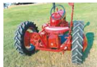
Cub was modified to 36-in. high and widened at the factory.