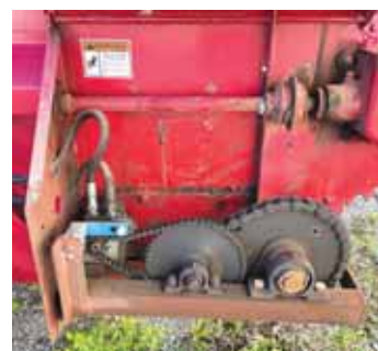
Chain drive installed on a spreader.

Contact: FARM SHOW Followup, David Nolt, 307 Eagle Rd., Kutztown, Penn. 19530 (ph 610-914-1248).