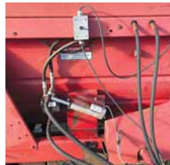
Actuator with a toggle switch on a magnet attached to spreader front.