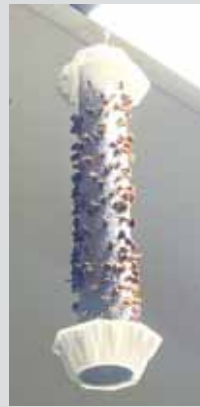
Raid Fly Stick works well on Asian beetles and other flying insects.