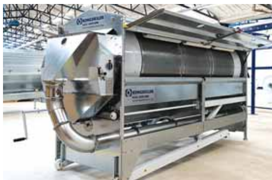
Grain inspection is easier because of more removable and cleanable windows. A large opening makes it easier to capture samples of cleaned grain.

Contact: FARM SHOW Followup, Camso, Magog, Quebec (ph 844-226-7624; ag.productsupport@camso.co; www.camso.co).