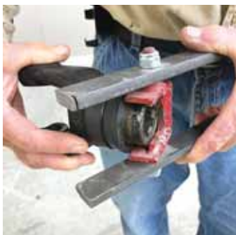
Decoupler flange tabs in place against coupler end.

Contact: FARM SHOW Followup, Jim Mueller, 1591 320th St., Hiawatha, Kan. 66434.