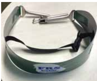
Belt has a quick release disconnect for animal safety.

Gerard Browne, FRS Direct online marketing executive, explains the safety feature of the belt. "When the animal can't be restrained and moves off quickly, one of the stainless-steel handles has a lever for a quick release, disconnecting the harness away from the animal to prevent any injury."