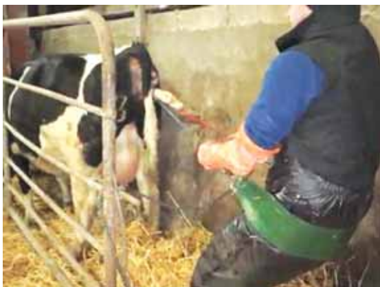
Calving Assist belt fits around the glutes, taking the strain off the lower back and shoulders. It takes advantage of body weight and leg power during the pulling process.