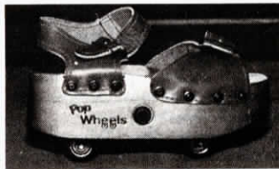
Here's how shoe, shown above, looks with the "pop wheels" engaged.

They come in three styles, the most popular having the recessed, pop-out skate mechanism. Two other models