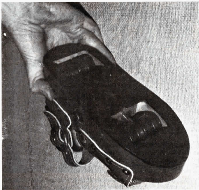
Recessed wheels "pop out" to convert the walking shoes into roller skates.