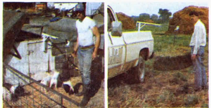
Scale goes most anywhere to weigh small animals, bales or whatever — up to 150 lbs.

Brooten Fabricating has launched a new custom lagoon or pit pumping