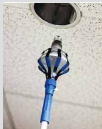
Extended pole with attachment that "grabs" bulbs for easy replacement overhead.

"This has been a best buy for me as it saves time and avoids dragging out a ladder to change a simple bulb. I now find myself using this tool to change all overhead light bulbs inside and out. It's one of those purchases I didn't know I needed until I had it."