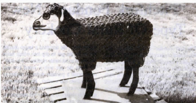
To make sheep Cumpston turns coil springs into wool and anhydrous knives into legs. Cultivator sweeps form pig ears (right) - baby giraffe is 9 ft. tall.

By 1981, Cumpston's work was being featured at art shows from coast to coast, selling at prices from $25 to $6,000. That's when he decided to devote full time to it