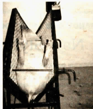
Rods at front and rear hold pig stationary.

Three sizes are available to handle pigs up to 40 lbs., to 70 lbs., and a large model for hogs weighing up to 185 lbs. The two smaller models sell for $99.50 (Canadian). The larger