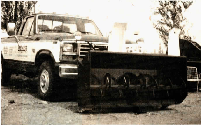
Front-mount snowblower is powered by engine in pickup box.