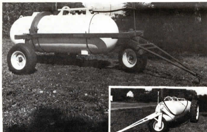
The Torpedo (lower right) has a 10,000 lb. test axle built right through the tank. The Row Rambler handles a 500 or 1,000 gal. tank.