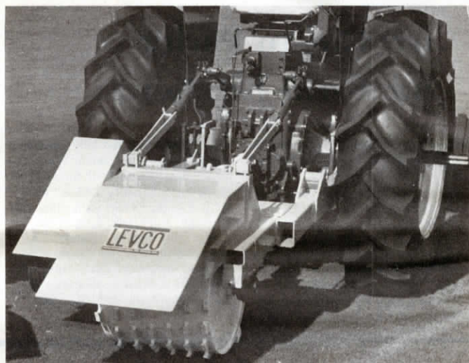
Equip your tractor with the model TW 1000 and you're "tooled up" and ready to do your own and custom stump grinding. Takes a 25 in. wide cut.

For more details, contact: FARM SHOW Followup, Reinke Mfg. Co., Deshler, Neb. 68340 (ph. 402 365-7251).