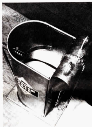
Foot-operated body band inside Caster Gate holds hog firmly but gently in either "up" or "down" position.

For more details, contact: FARM SHOW Followup, Mixing Machine, c/o Mark Benson, 432 East 12th Street, Hutchison, Kan. 67501 (ph. 316-663-6945).