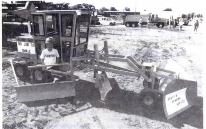
Scott built "mini" road grader for his 5-year-old grandson Kenyon.

automatically. A valve in the hose beneath the pail controls the flow of water into the cup on the counterbalanced arms. The cup on the arms is cut out on the side so when it drops, water cascades out, sending the arm