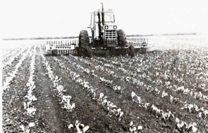
Largest model (260 in.) covers 12 22-in. sugar beet rows per swath. It weeds and mulches crops, from early emergence to a foot or more tall, without damaging the crop, says manufacturer.