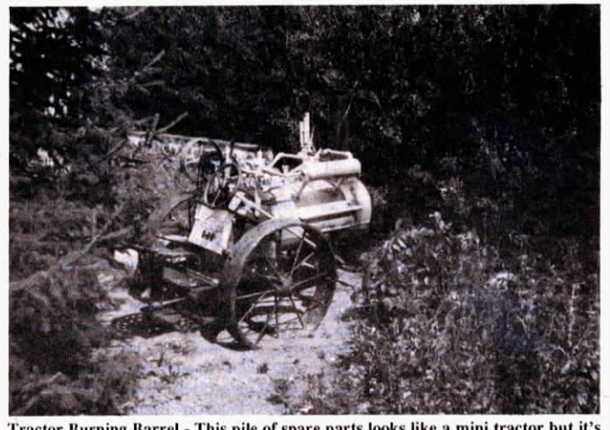
Tractor Burning Barrel - This pile of spare parts looks like a mini tractor but it’s actually a trash burning barrel rigged up to look like a tractor. Trash goes into a door just ahead of the tractor seat and smoke goes up the chimney in front.