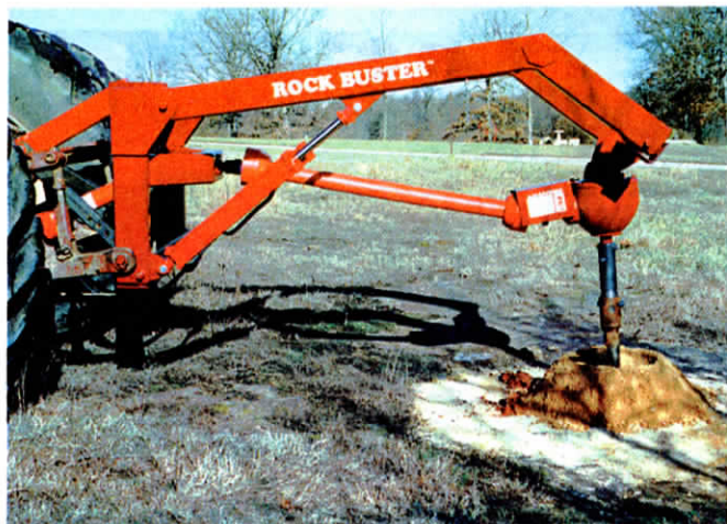
Pto-driven digger uses weight of tractor to apply up to 5,000 lbs. of downpressure for high speed drilling. It's designed for 3-pt. mounting on 60 hp or larger tractor.