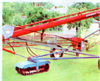
Auger's 18-in. wide rubber track is driven by orbit motor and fitted with hydraulic steering cylinder.

It's controlled by a set of valves that mount on the auger tube and comes complete with a hydraulic pump. If you have an engine driven auger, you can drive the pump