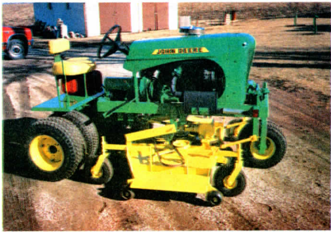
Single wheel at the front of Snell's home-built mower turns 180°, allowing him to trim around small trees. Dual wheels on back provide needed stability.