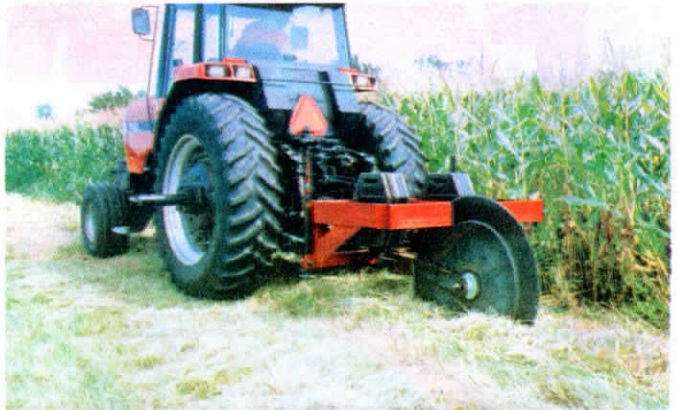
It's less than an inch wide at the widest, say inventors of this new coultter subsoiler that works down to a depth of 18 in. without the need for a high horsepower tractor.

Pulling silage wagons behind the pickup lets one person keep up with a chopper working several miles away because he can