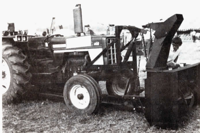
Hookup allows front-mounted blower to be raised and lowered hydraulically.

For more details, contact: FARM SHOW Followup, Northeast Implement Corp., Spencer, N.Y.