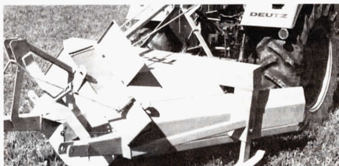
Two-way blower has 3 pt. hitch on both the front and rear.