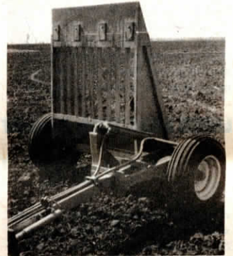
Dirt falls through 2.5 in. grate spacings as picker is raised into dump position.

"People have tried to build similar rigs in the past but they weren't as big, they weren't as cheap, and they