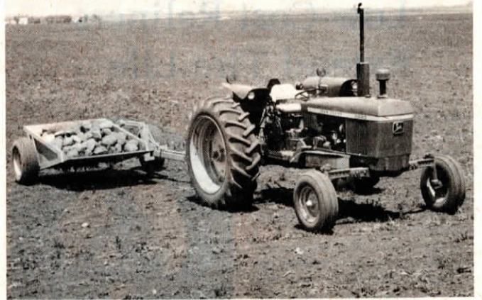
Front 60 in. wide plate scoops rocks out of the field.

For more information contact: FARM SHOW Followup, Venture Ridge Mfg., Inc., Rt. 8, Box 111-C, Hwy. 14, Greer, S.D. 29651 (ph 803 877-3328).