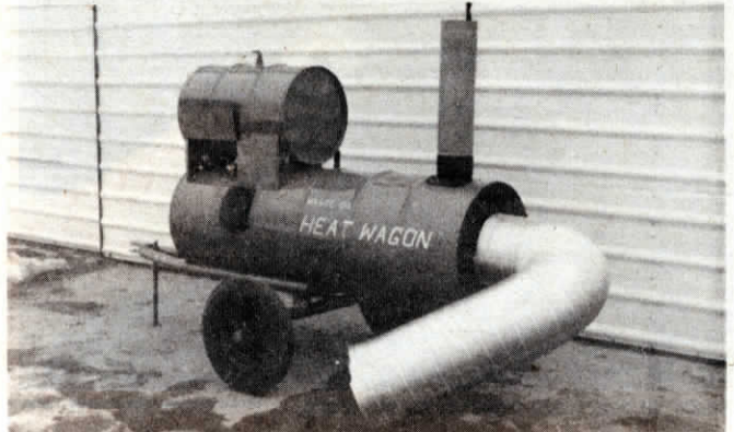
Inventor says make-it-yourself "Heat Wagon" is better than units that cost up to $3,000.

All-season safety trousers have 2 pockets in front, 1 in back. They protect both legs (11 layers front, 3 layers