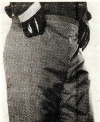
Material, layered 11 times, can stop a chain saw turning at 4,000 ft. per sec.

For more information, see your nearest Husqvarna or Oregon chain saw dealer. Or, contact: FARM SHOW Followup, Husqvarna Power-Products Co., Nordtec Division, 224 Thorndale Ave., Bensenville, Ill. 60106 (ph 312 595-8500).