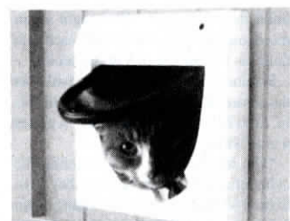
Door is activated by an electronic collar on your cat or small dog.

through mail order catalogs and retail outlets, varying in price from $99 to $175. For where-to-buy information, contact the distributor: FARM SHOW Followup, Reilor, Inc., 417 Caredean Dr., Horsham, Penn. 19044 (ph 800 521-5294).