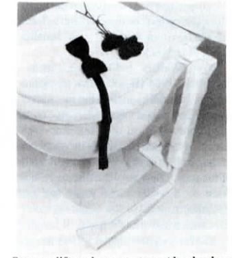
Step-on lifter always puts seat back when you're done.

Contact: FARM SHOW Followup, Consumer Solutions, 1631 The Queensway, Toronto, Ontario M8Z 5Y4 Canada (ph 416 252-2241).