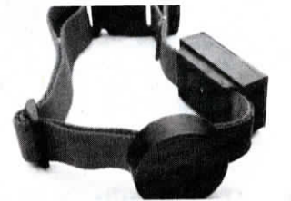
A transceiver activates the collar to produce a burst of sound whenever dog barks.

A patented new transceiver on the new Elexis collar activates the collar to produce a short, harmless burst of sound whenever a dog barks. The sound doesn't hurt the dog but distracts it so it stops barking. Anyone listening will only hear a "click".