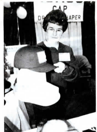
Cap dryer also works great for organizing cap collections.

For more information, contact: FARM SHOW Followup, Tomco, Box 339, McLeansboro, Ill. 62859.