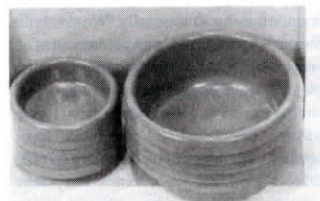
Plastic bowl is impregnated with an insect repellent.