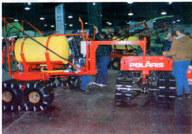
Continuous loop tracks mount over existing wheels. Note new gooseneck hitch that transfers weight of sprayer to ATV.

Make check payable to FARM SHOW. Clip and mail this coupon to: FARM SHOW, 20088 Kenwood Trail, P.O. Box 1029, Lakeville, Minn. 55044.