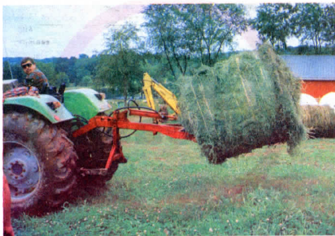
Pivot point on 3-pt. hitch allows bale handler to lift higher than most 3-pt. bale spears.