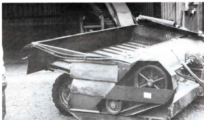
Streff mounted old cornpicker conveyor on back of his 4-row flail chopper to windrow stalks off to side of machine.