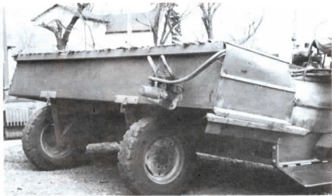
An orbit motor is used to power conveyor and to control its speed.