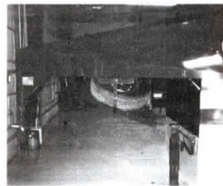
Trailer's sloping neck has locked compartment inside to hold spare tire and an air vent that pulls fresh air into trailer.

Trailer is painted inside and out with an epoxy primer and then final-coated on the outside with the high-quality polyurethane paint that Lillibridge says won't fade and is