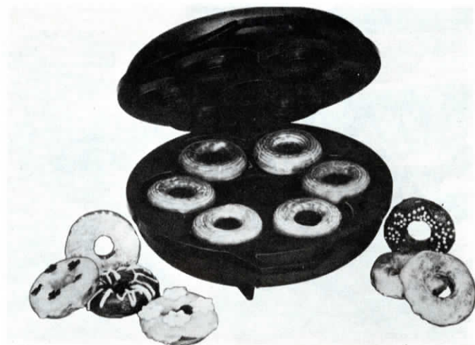
New from Northern Electric Co., 5224 N. Kedzie Ave., Chicago, Ill., is this six-hole unit called The Donut Bakery (Model 2081). Suggested retail is $35.95.