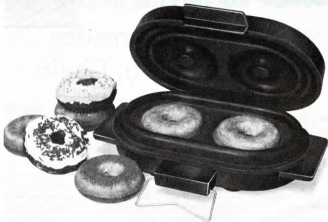
New Donut Factory from Dazy Products reportedly makes donuts for less than 4 cents apiece, including your choice of frosting.