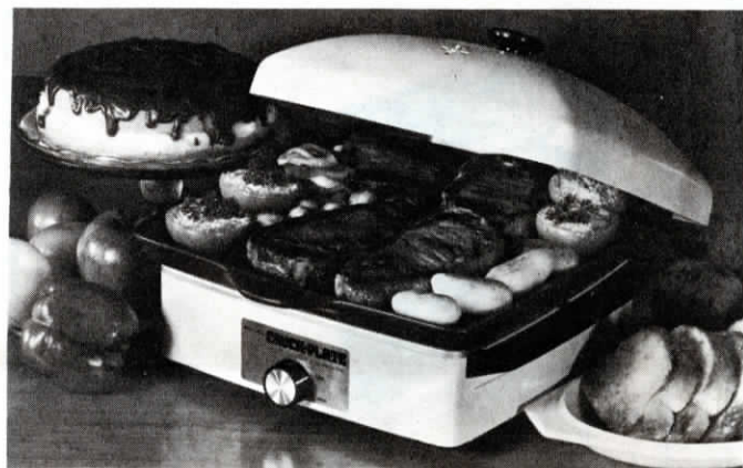
The new Crock-Plate picks up where the Crock-Pot leaves off, says Rival Mfg.

It's anticipated that other major suppliers, including Hamilton Beach, Wingaersheek and Van Wyck will have electric donut makers on the market within a matter of months.