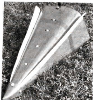
Plastic "crop lifters" are bolted into place at the top of each snout.

They fit most popular corn and row crop heads and sell for $8.95 per row.