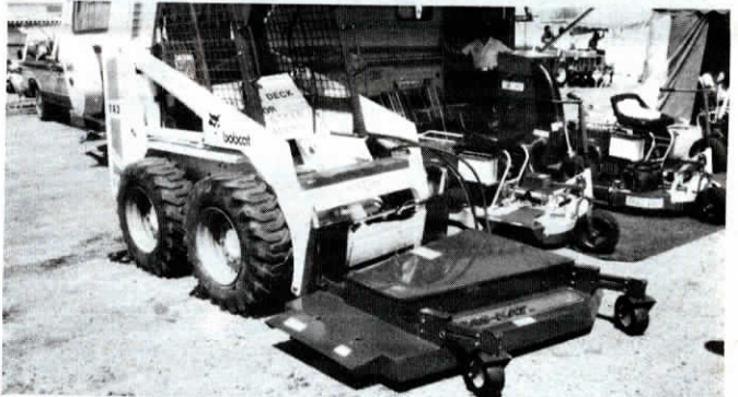
"Gras-Kat" mower quick-attaches to the front of the skid steer loader and quick couples to its auxiliary hydraulics.

For more information, contact: FARM SHOW Followup, B & B Manufacturing, Rt. 2, Box 237, Wisner, Neb. 68791 (ph 402 529-6169 or 6023).