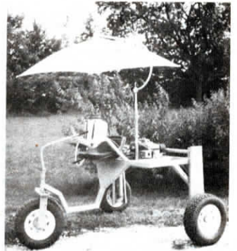
Buggy's front wheel is used to steer and can be controlled by either a hand lever or with footrests.

Although it's lightweight, Nitzsche says the weeder is almost impossible to tip over because of the wide wheel base and low center of gravity. There's 35 in. of clearance at the back to "walk" the machine over maturing soybeans, or other crops, without